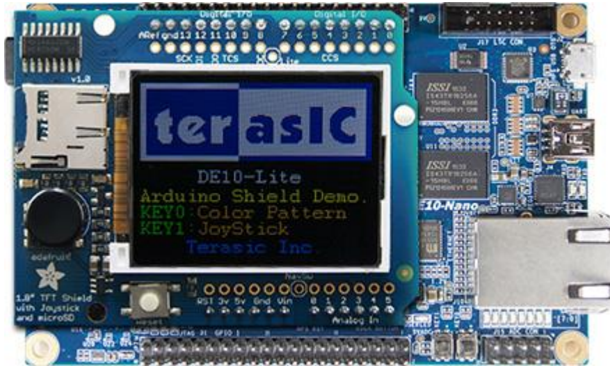
Figure 1 Arduino Shield 1.8" color LCD Demo

This document illustrates how to setup the Arduino Shield 1.8" LCD demo on the DE10-Nano and the Arduino Shield 1.8" LCD as shown in Figure 1 . The basic design content is also included. For details about how to use DE10-Nano board resources, please refer to the DE10-Nano user manual. For details about the Arduino Shield 1.8" LCD, please refer to the web side Adafruit 1.8" TFT LCD shield .