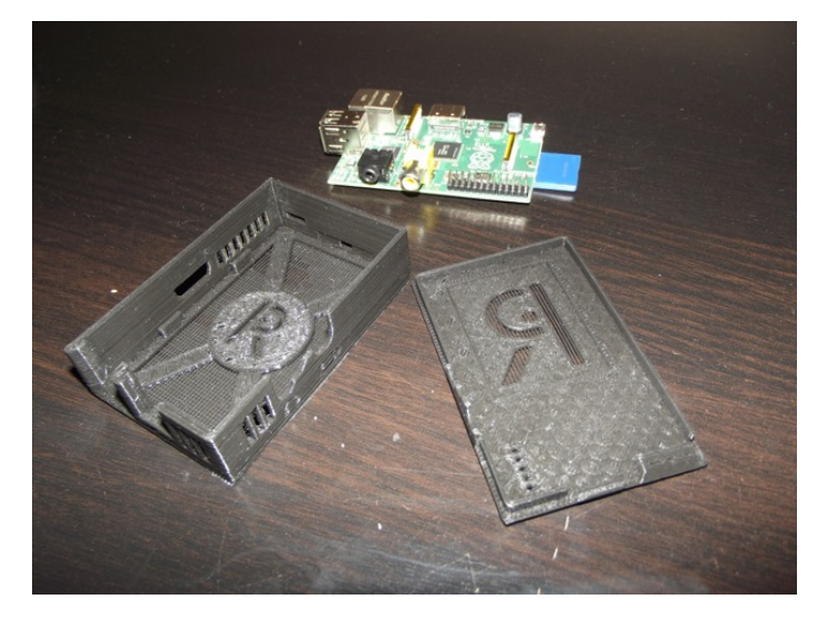
Boxing our Raspberry Pi