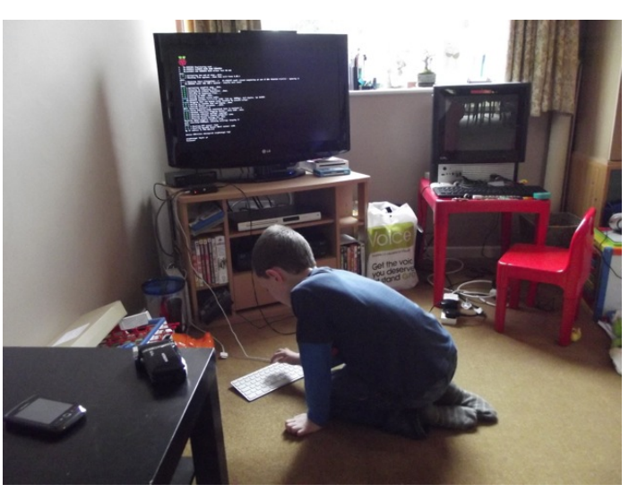
Philip in action