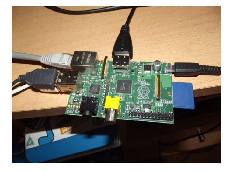
Plugged in and ready to go!

We decided to make a short video of the game and of using